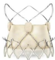
Edwards Sapien 3